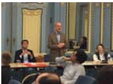
Award ceremony