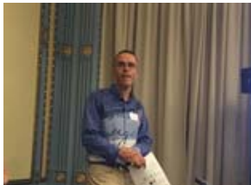
Opening remarks (Buskens)